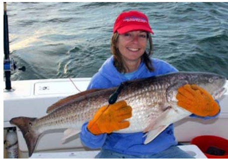
Redfish with Pop-up Tag